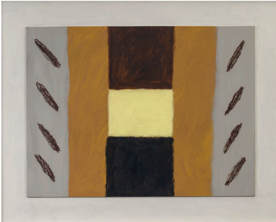
Autumn Landscape , 2009, Acrylic on board, 82.2 x 101.5 x 3 cm, Unique

TO PAINT IS TO WAIT AND WATCH, TO TRY AND LISTEN TO THE PICTURE, TO CHANCE A STROKE, TO HOPE FOR THE BEST.