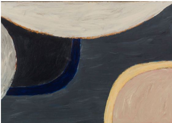
Leda and the Swan II , 2004, Acrylic on board, 56.5 x 78.2 cm, Unique