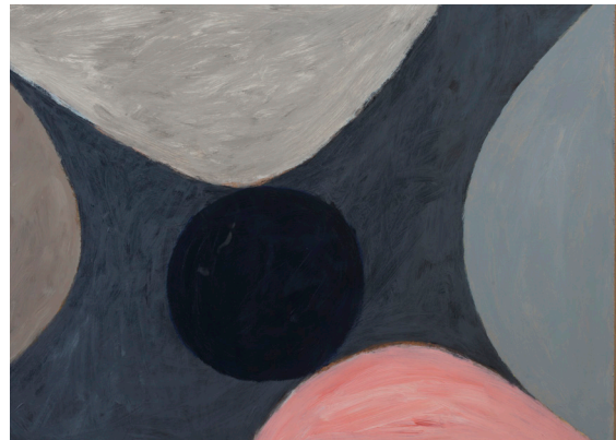
Leda and the Swan III , 2004, Acrylic on board, 82.2 x 112 cm, Unique