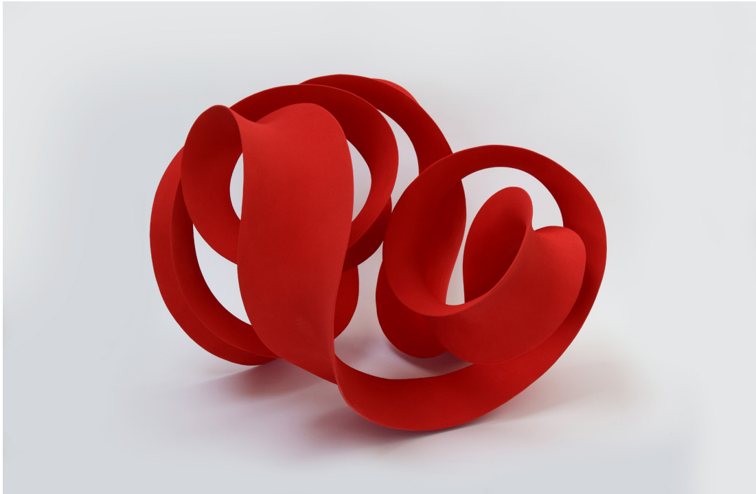
Joyous Red , 2022, Ceramic with coloured slip, Unique