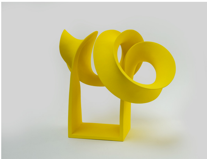
Emergent Yellow 2022, Ceramic with coloured slip, Unique

Gallery open Monday - Saturday, 10am - 6pm