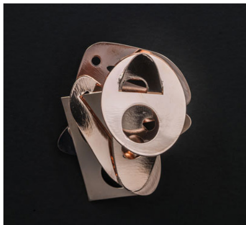
Antares, 2019, Rose Gold on Brass