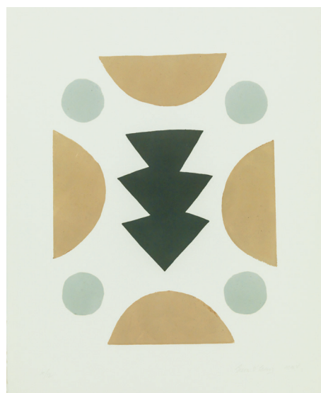
BREON O'CASEY Angular Form 2001, Linocut, Edition of 12