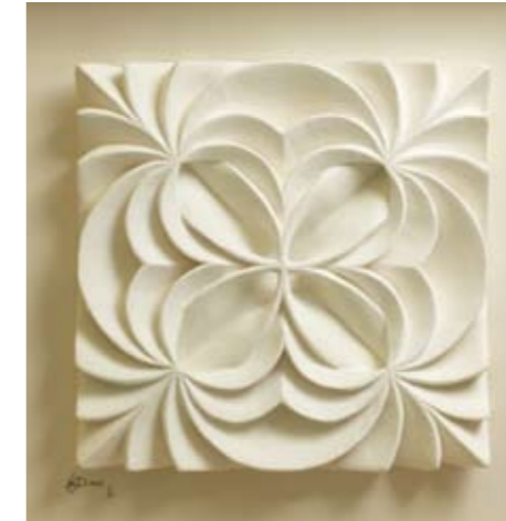
HALIMA CASSELL Cursive, Fugue, Tulip, Echo, Pendula Palmate, Sidewinder, Foliata, Cygnes, Sola Hand carved porcelain stoneware Edition of 10 56 cm high