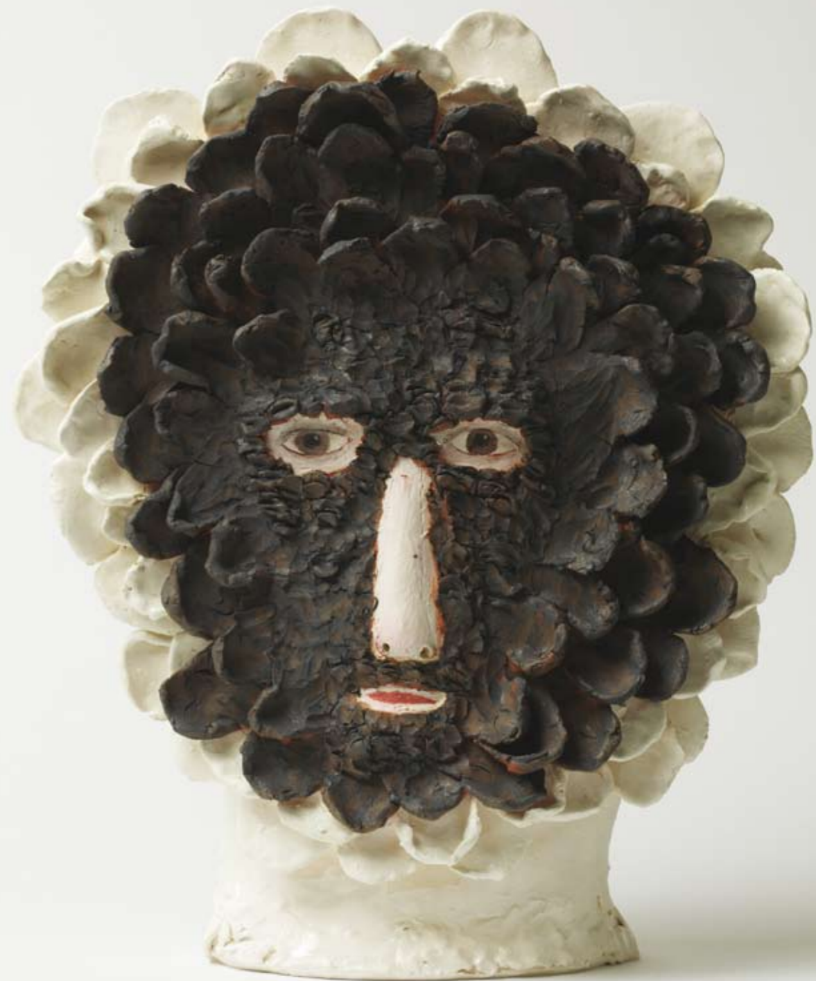
CLAIRE LODER Petal Clay, slip, oxide, glaze 38 cm high