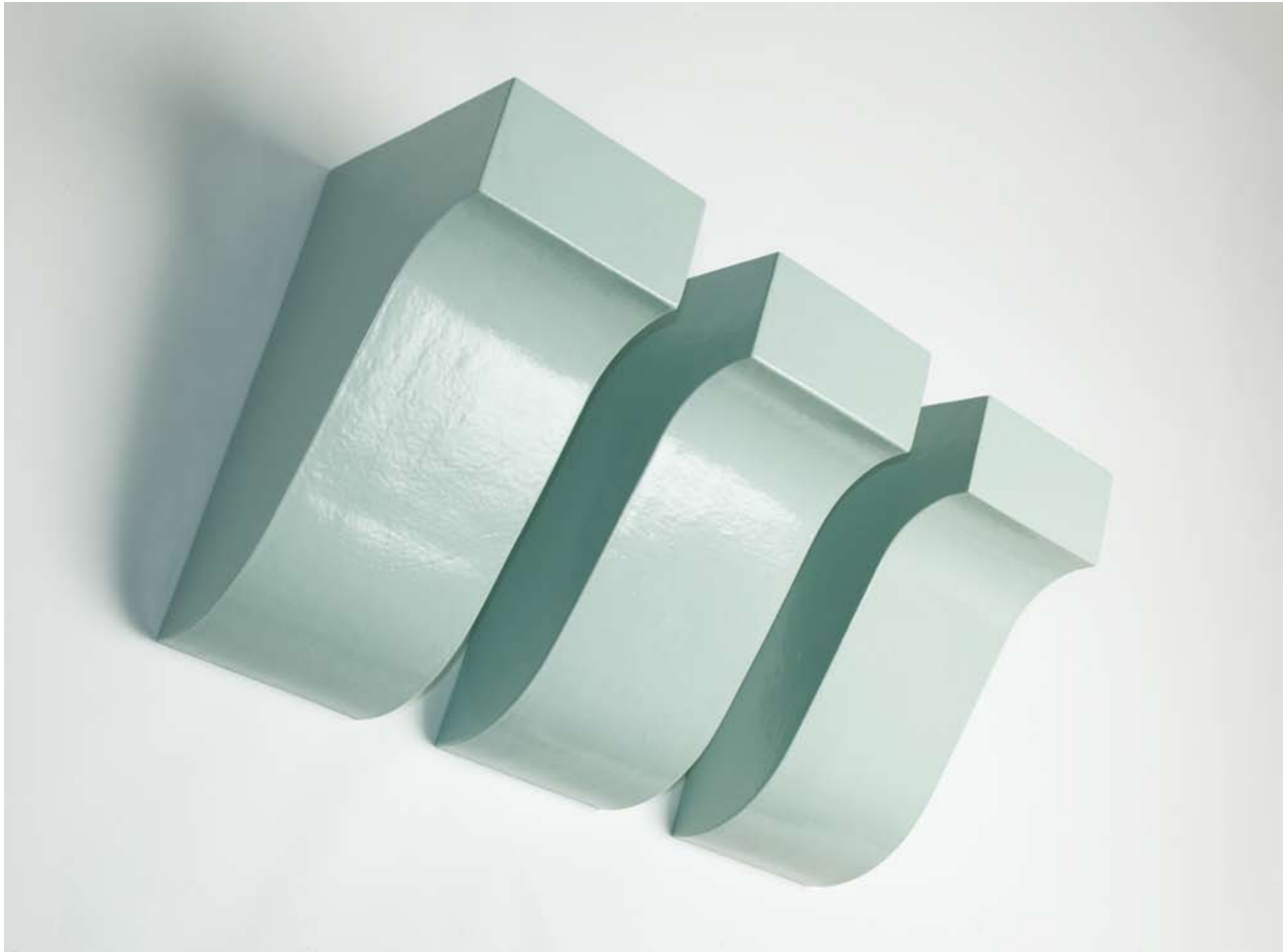
JAMES RIGLER Cornice Ceramic 41 cm high