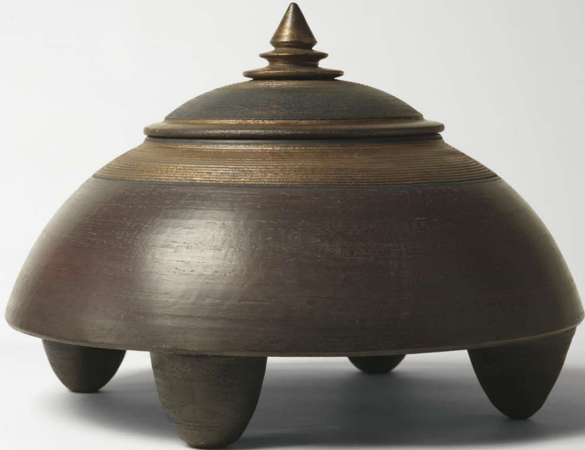
JASON WASON Gold and Brown Templetop Vessel Fired clay 35 cm high