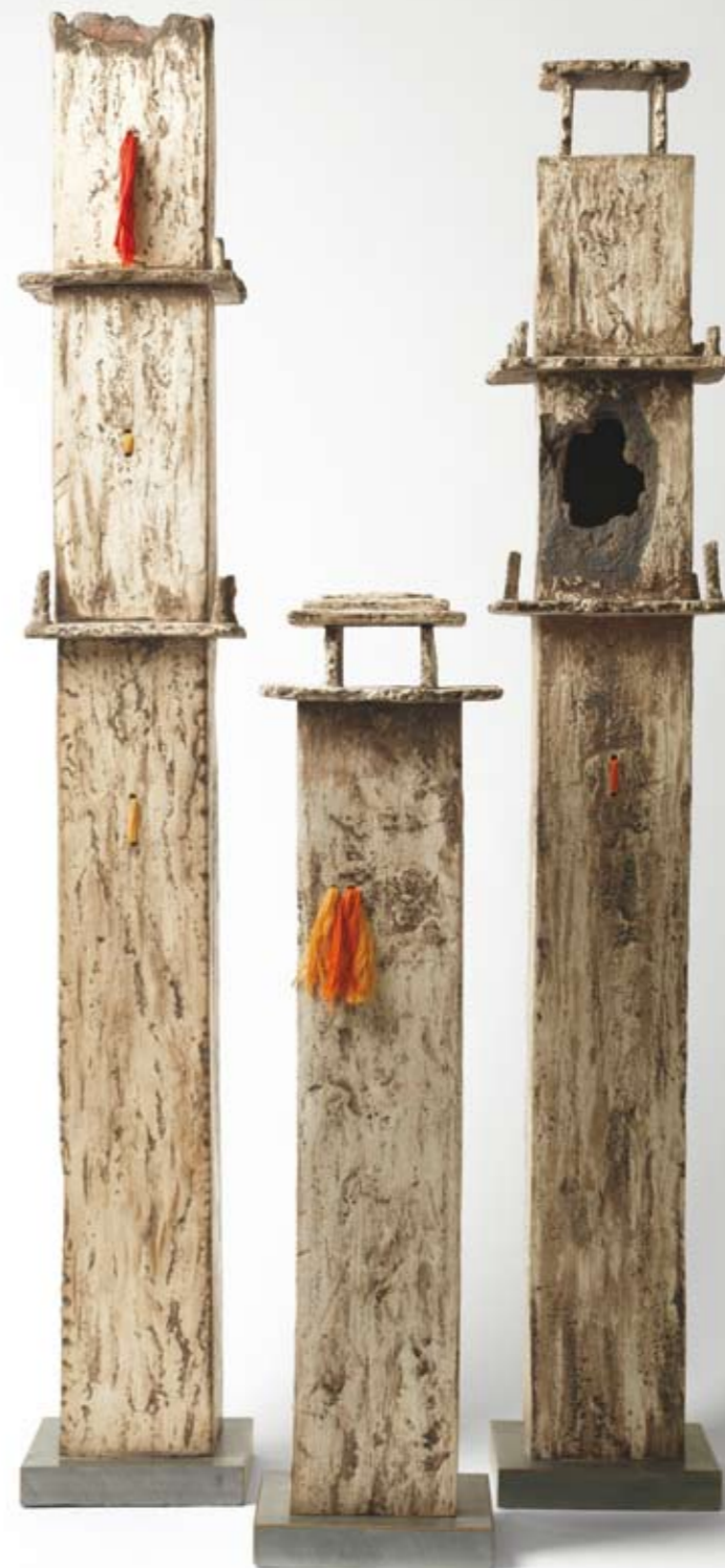
JASON WASON Towers Fired clay and thread 69 - 115 cm high