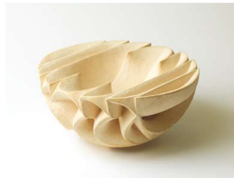
HALIMA CASSELL Rococo Hand carved, unglazed stoneware clay 23 cm diameter