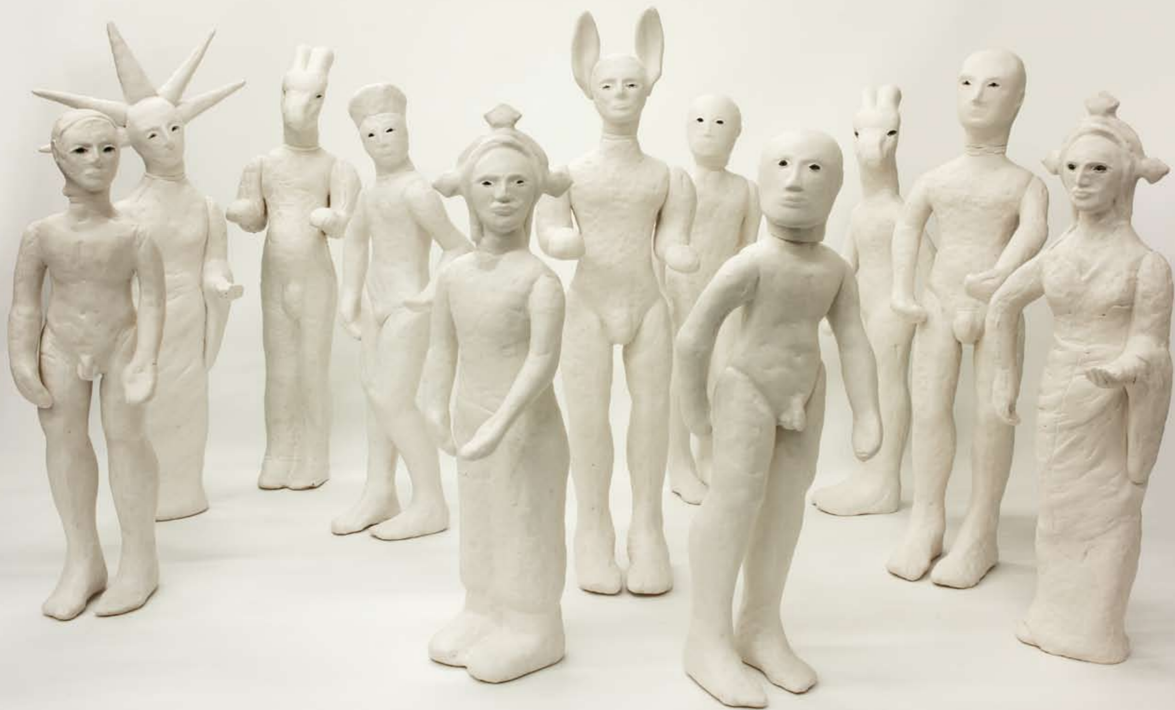
CHRISTIE BROWN Sleepover Ceramic 73 - 90 cm high