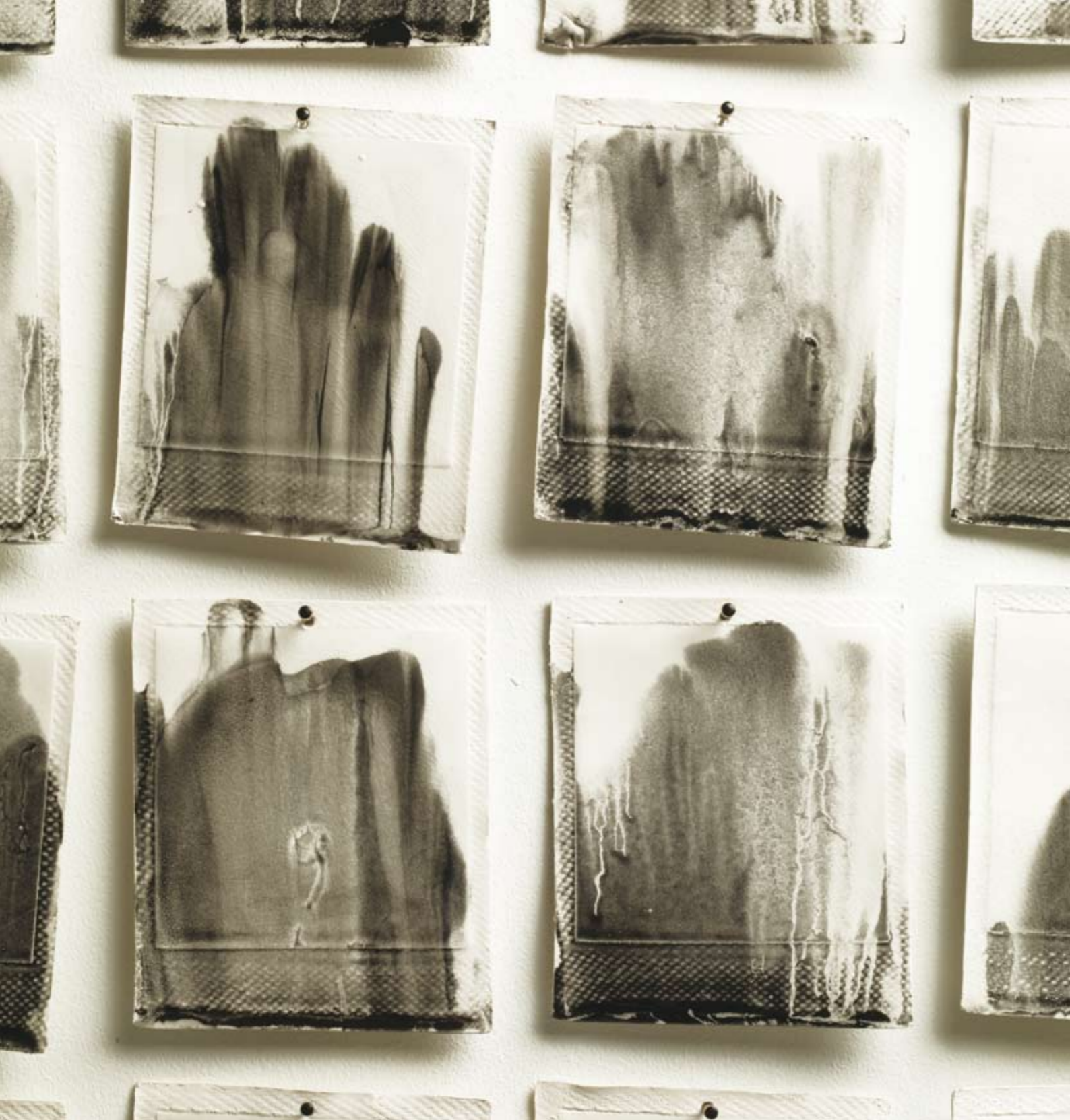
CLARE TWOMEY Temporary (detail) Porcelain and glaze Installation