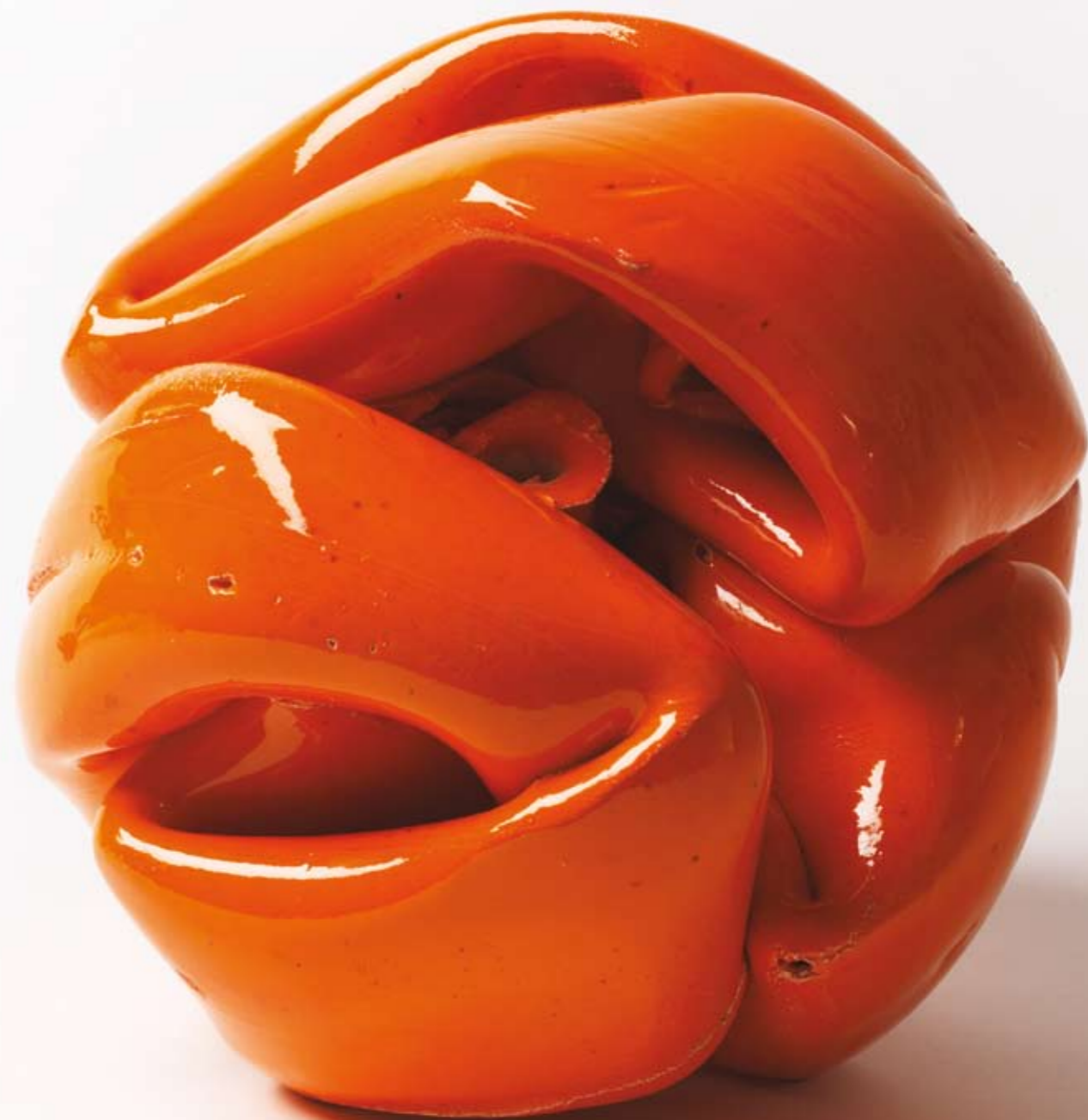
JULIAN WILD Tangerine 2 Glazed stoneware 23 cm high