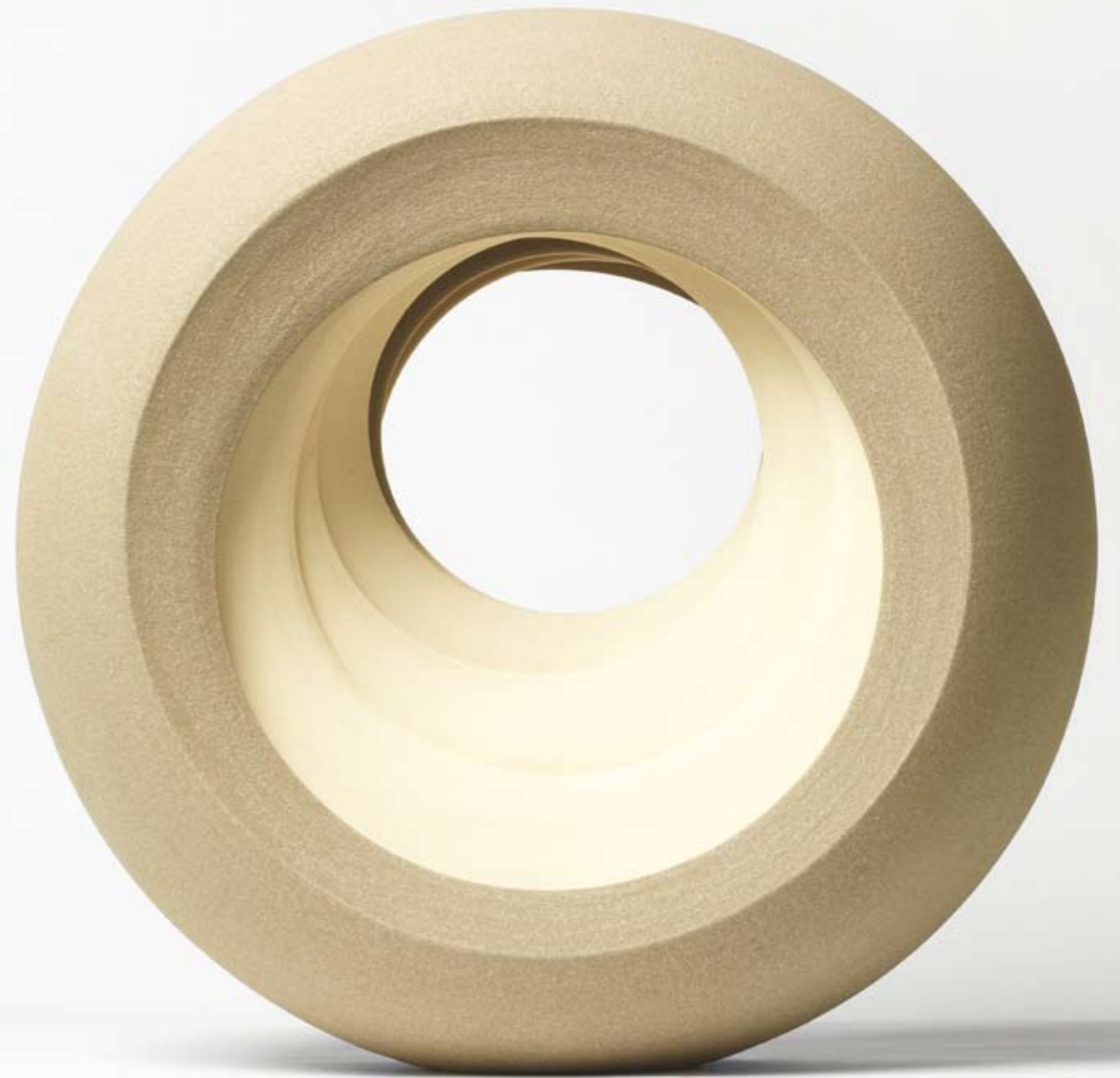
MATTHEW CHAMBERS Eclipse Stoneware with oxide editions 46 cm high