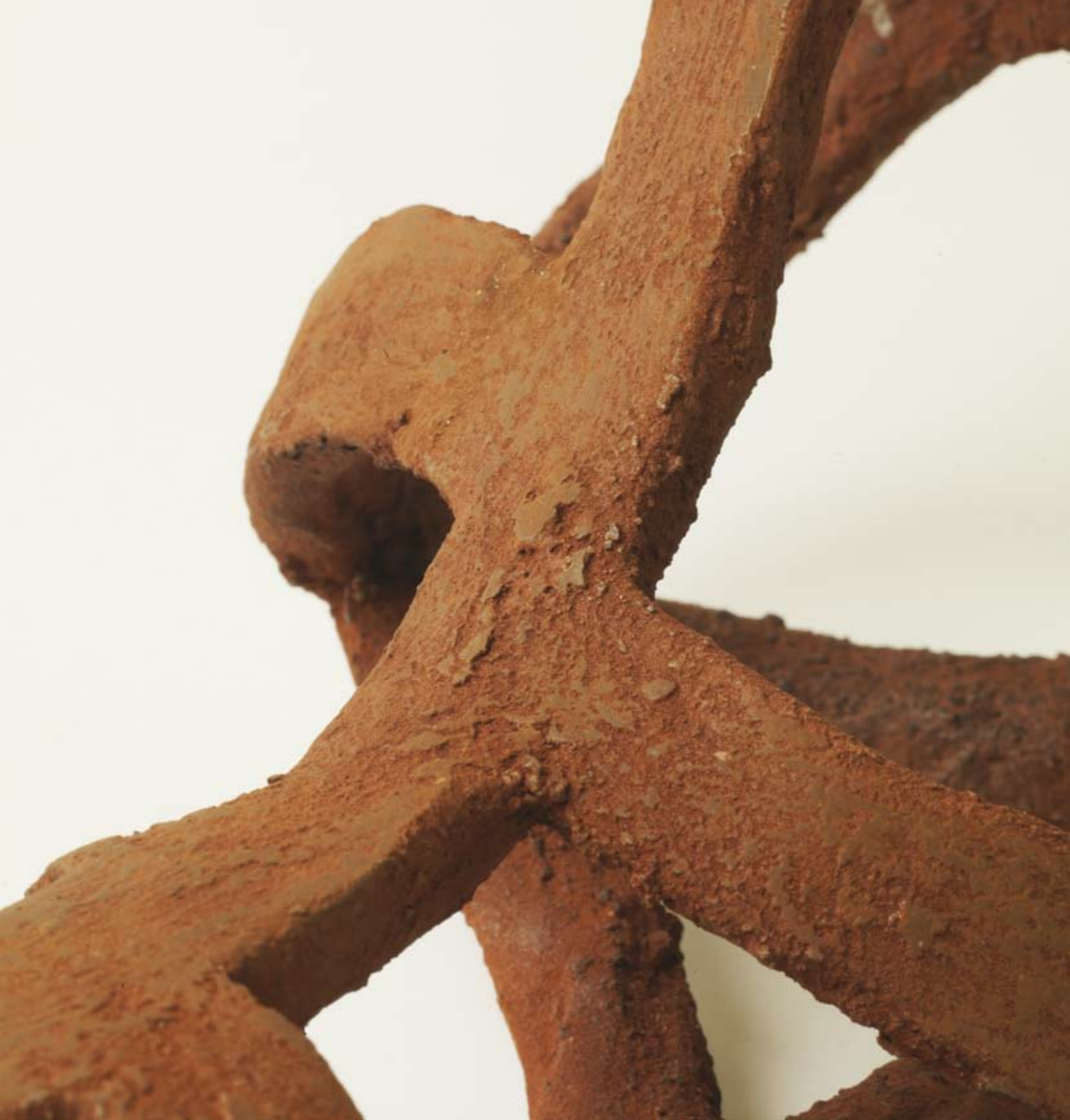
JAMES EVANS Confines of Comfort Rusted Ceramic 30 cm high