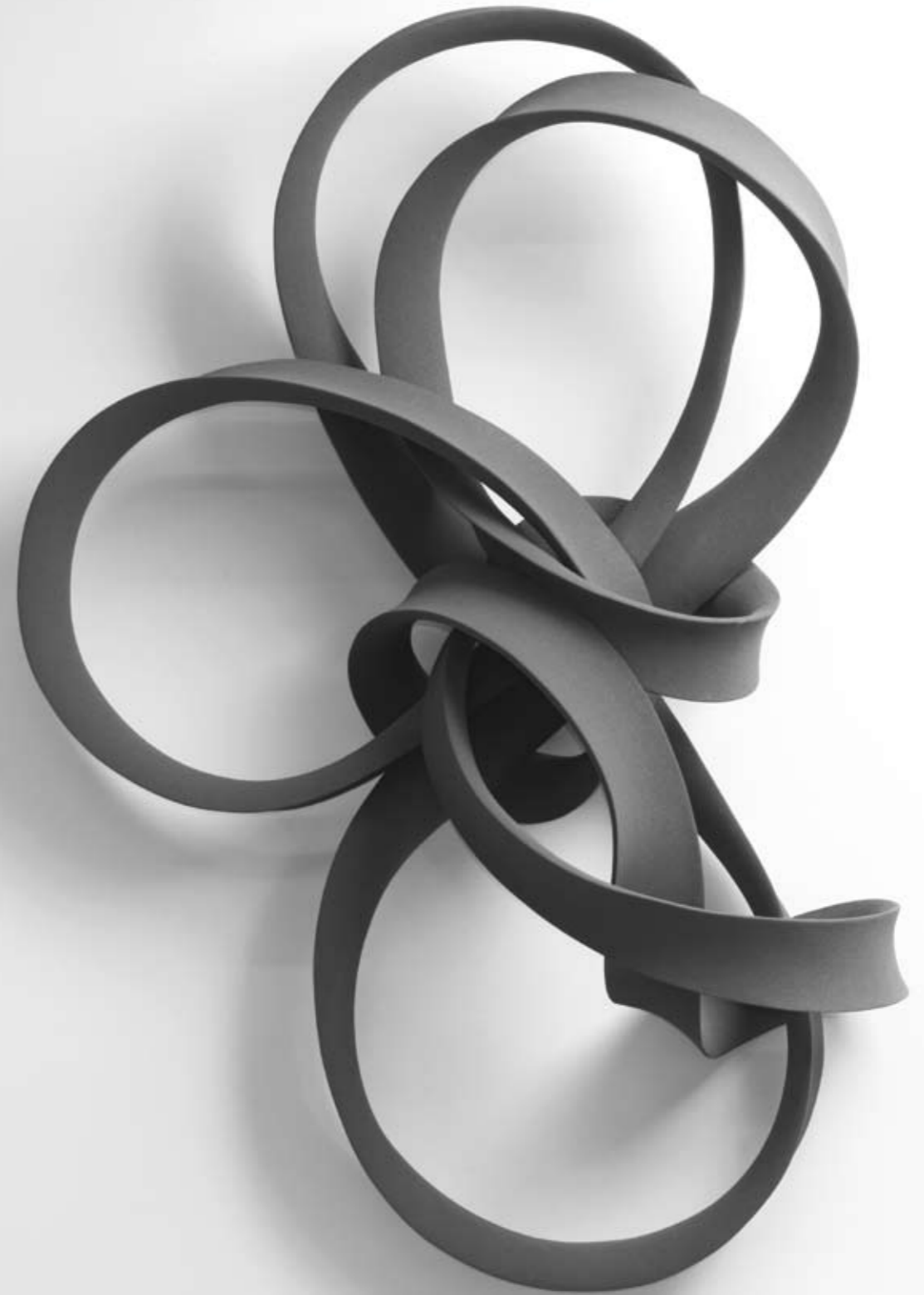
MERETE RASMUSSEN Dark Grey Multi-Loop Ceramic with coloured slip 70 cm high