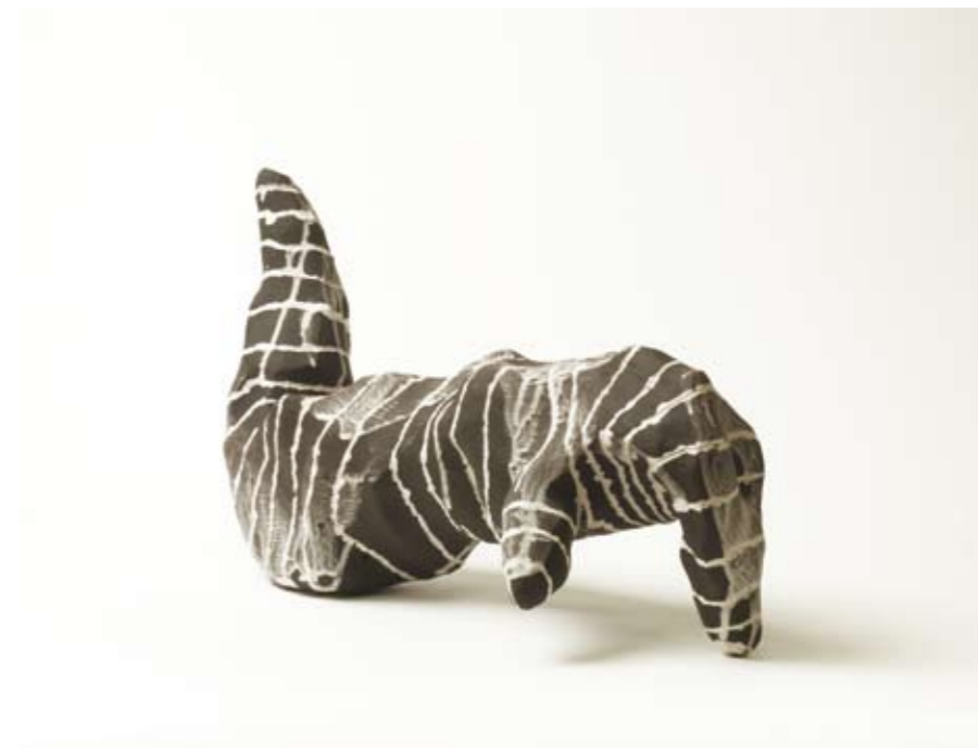
NAO MATSUNAGA The Horned One Black clay porcelain 39 cm high