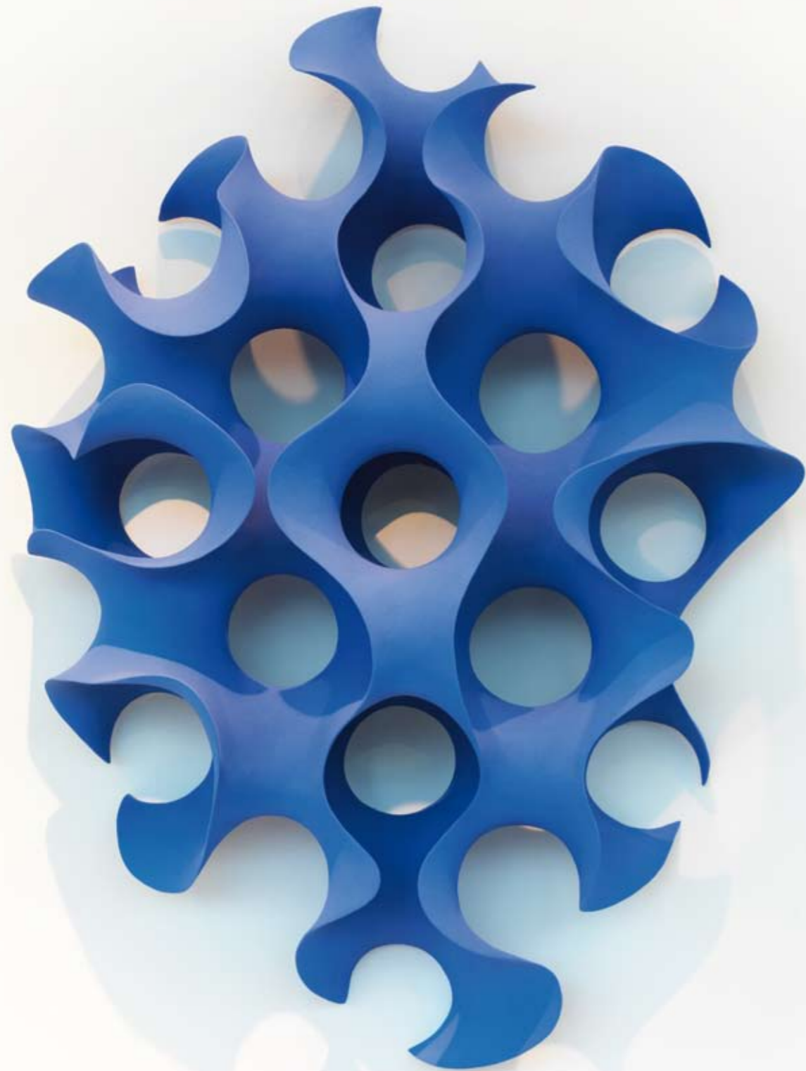
MERETE RASMUSSEN Blue Form Ceramic with coloured slip 95 cm high