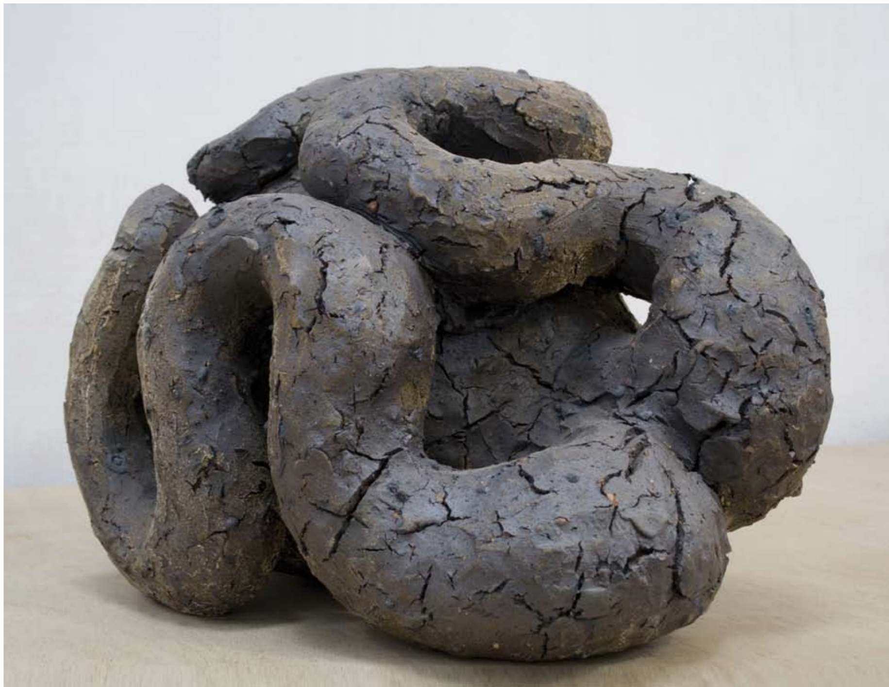
PETER RANDALL-PAGE From the Depths Ceramic 31.5 cm high