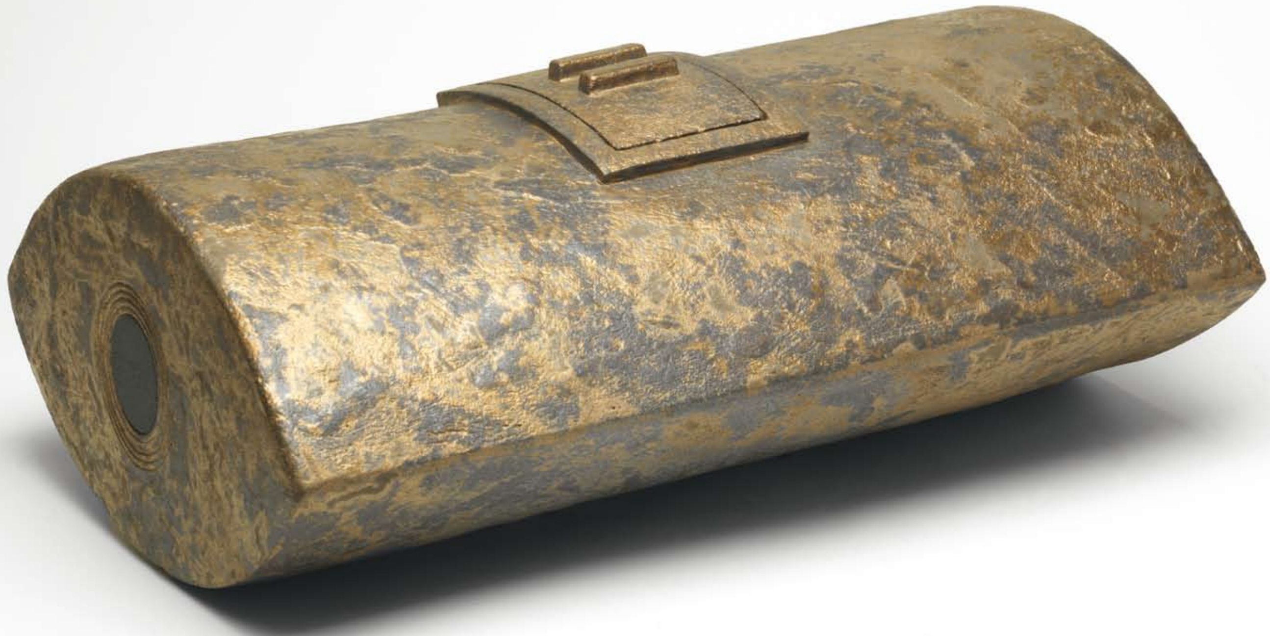
JASON WASON Preservation Box Fired clay 50 cm long