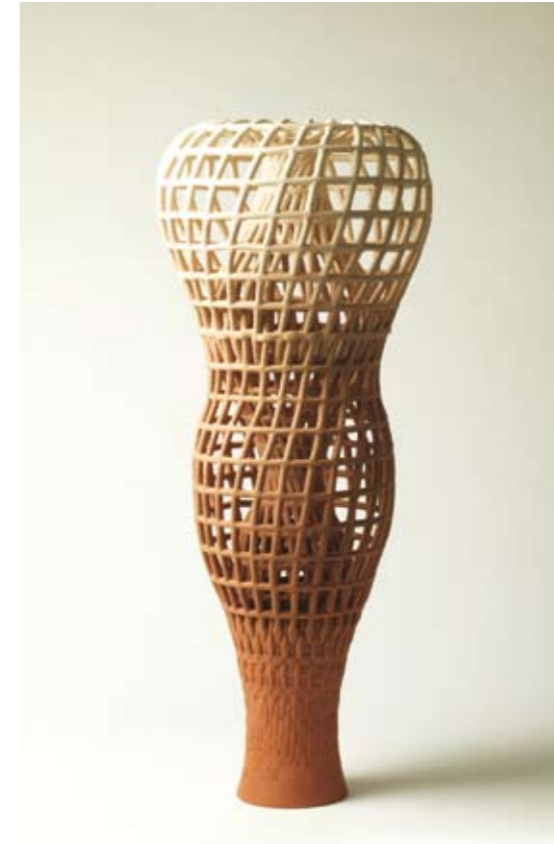
STEVE BUCK Eversion 2 Blends of stoneware and red clay 82 cm high