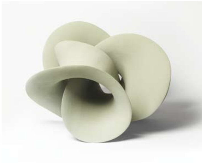
MERETE RASMUSSEN Grey Form Ceramic with coloured slip 40 cm high