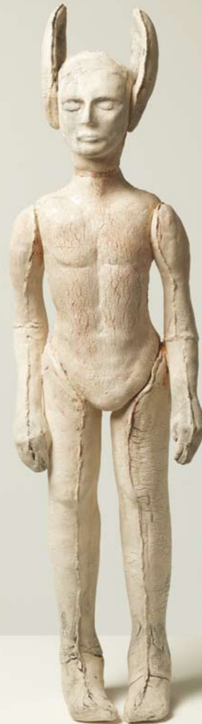
CHRISTIE BROWN Elf Ceramic 83 cm high