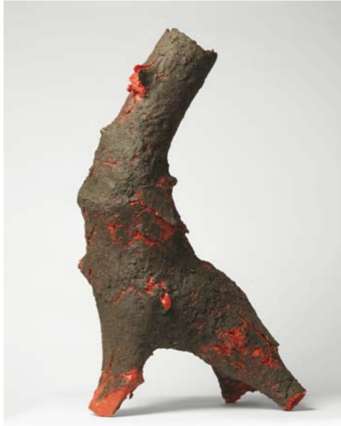
ANETA REGEL DELEU Black Untitled Stoneware clay with volcanic rock components 78 cm high