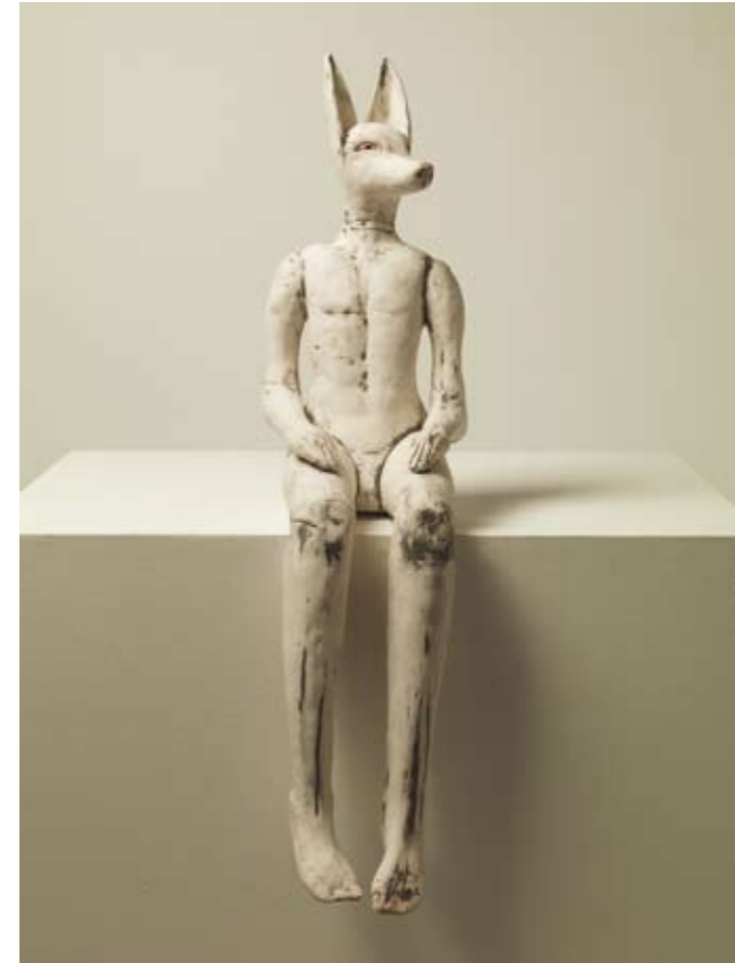
CHRISTIE BROWN Seated Dog Ceramic 85 cm high