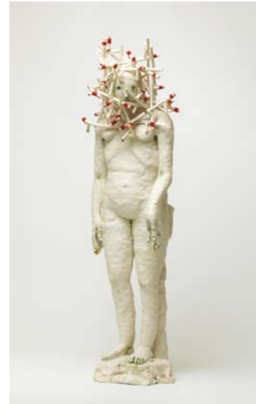
CLAIRE CURNEEN Stick Figure Porcelain, gold lustre and cotton 80 cm high