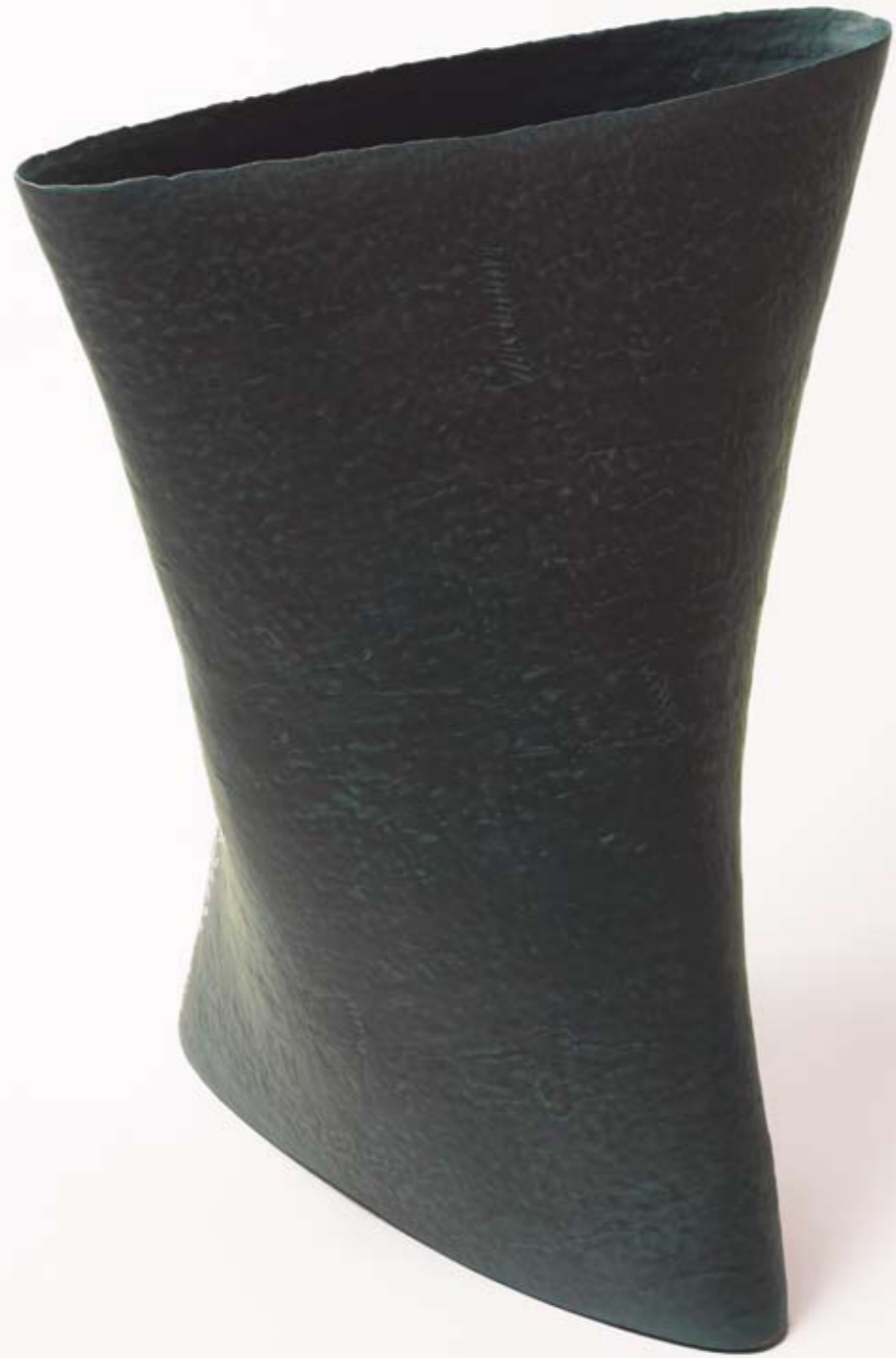
SARAH SCAMPTON Untitled Stoneware and slip 64 cm high