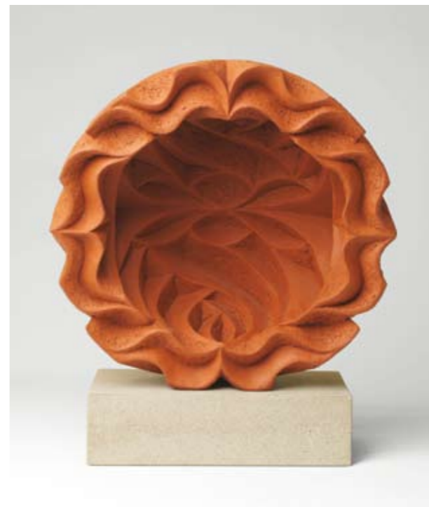
HALIMA CASSELL Fandango Hand carved, unglazed stoneware clay 46 cm high