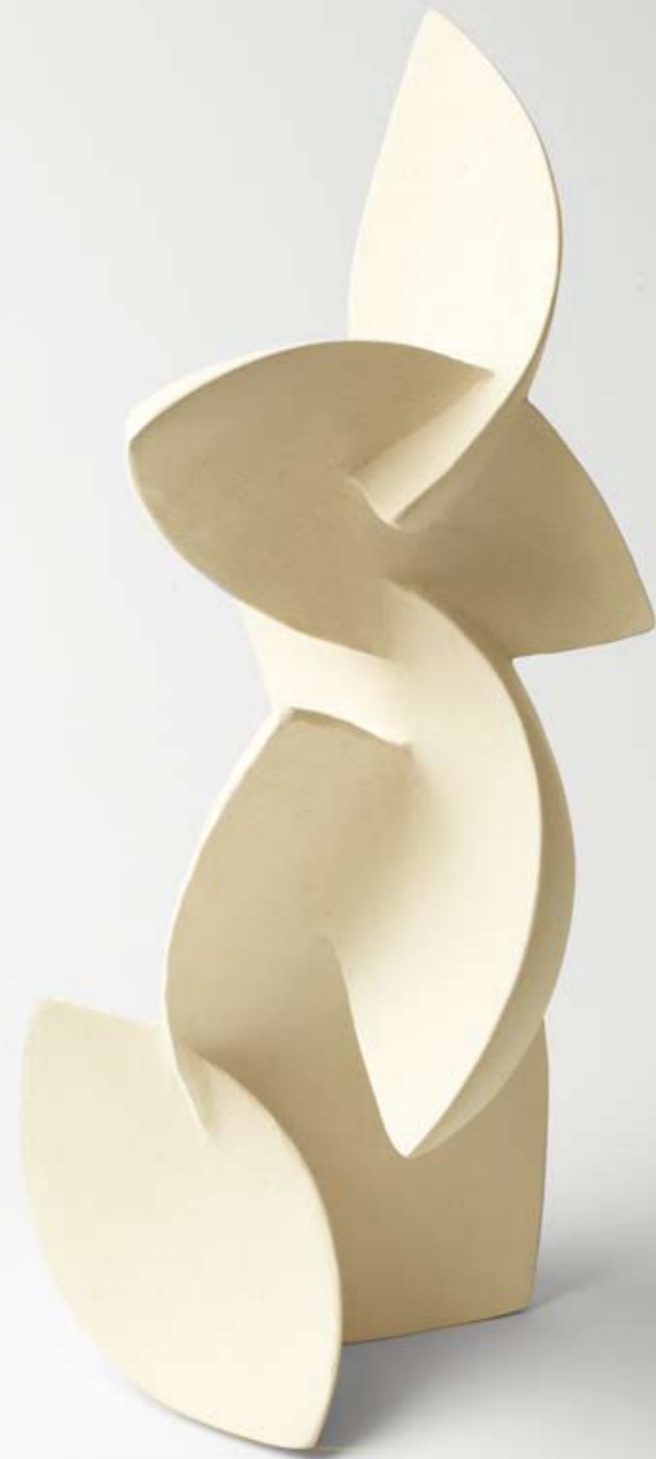
ALMUTH TEBBENHOFF We-Need-Each-Other No.3 Ceramic 34 cm high