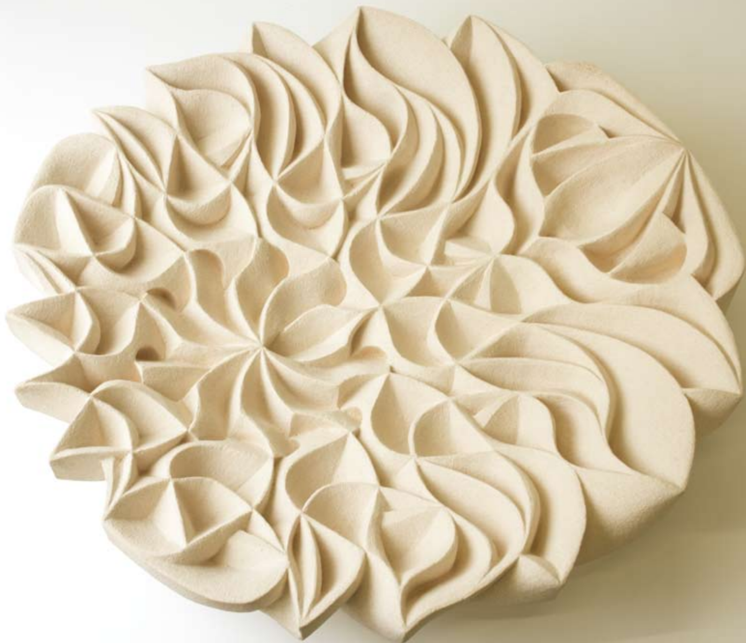
HALIMA CASSELL Sema Hand carved, unglazed stoneware clay 61 cm diameter