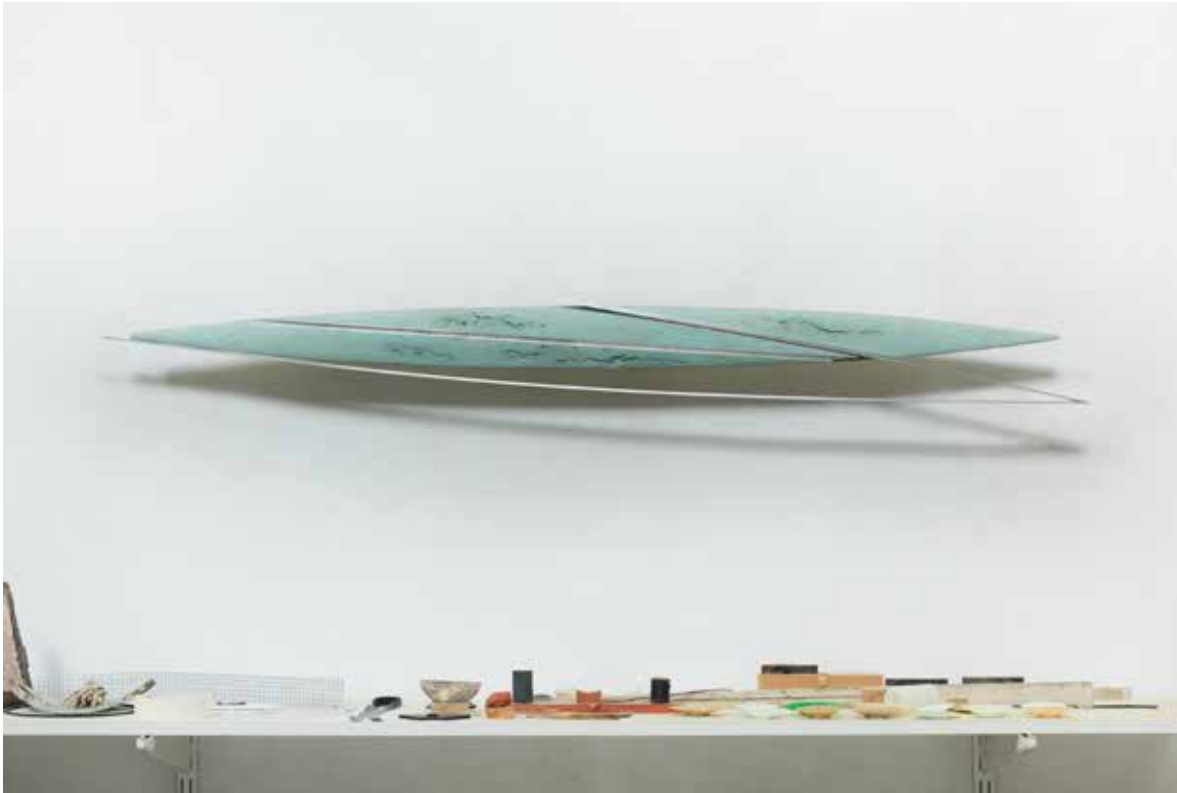
Silent Journey , 2016, Bronze (prior to casting)