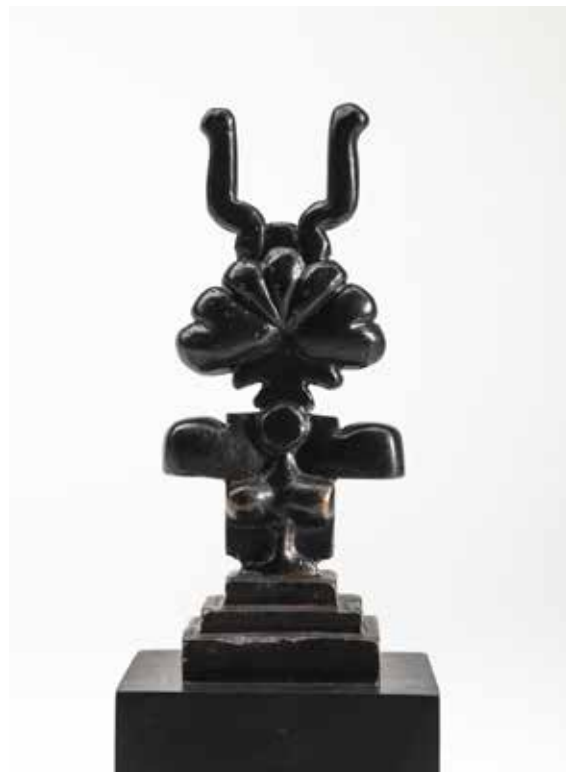
Bronze 3 , 1969, Bronze and slate