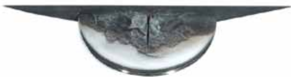
ANN CHRISTOPHER White Light Sterling Silver