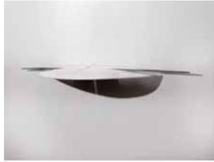
ANN CHRISTOPHER Silent Space Resin & Aluminium