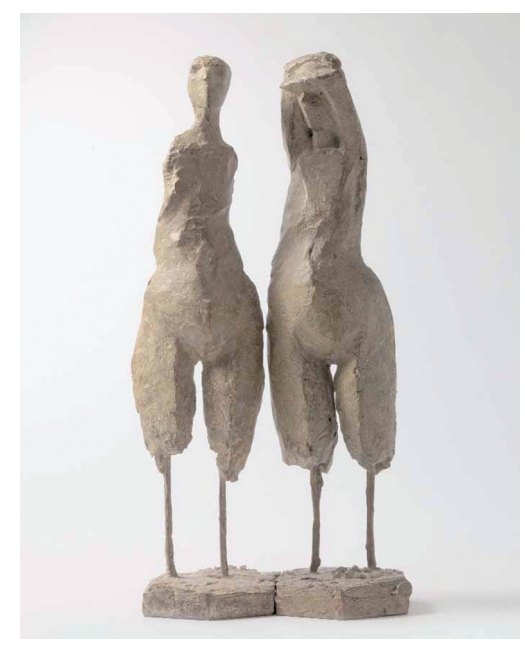
ANTHONY ABRAHAMS Looking, Not Looking