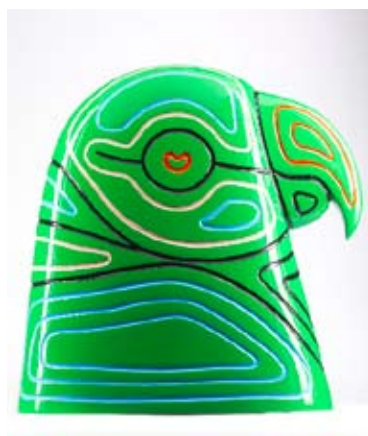
JON BUCK Parrot Fashion