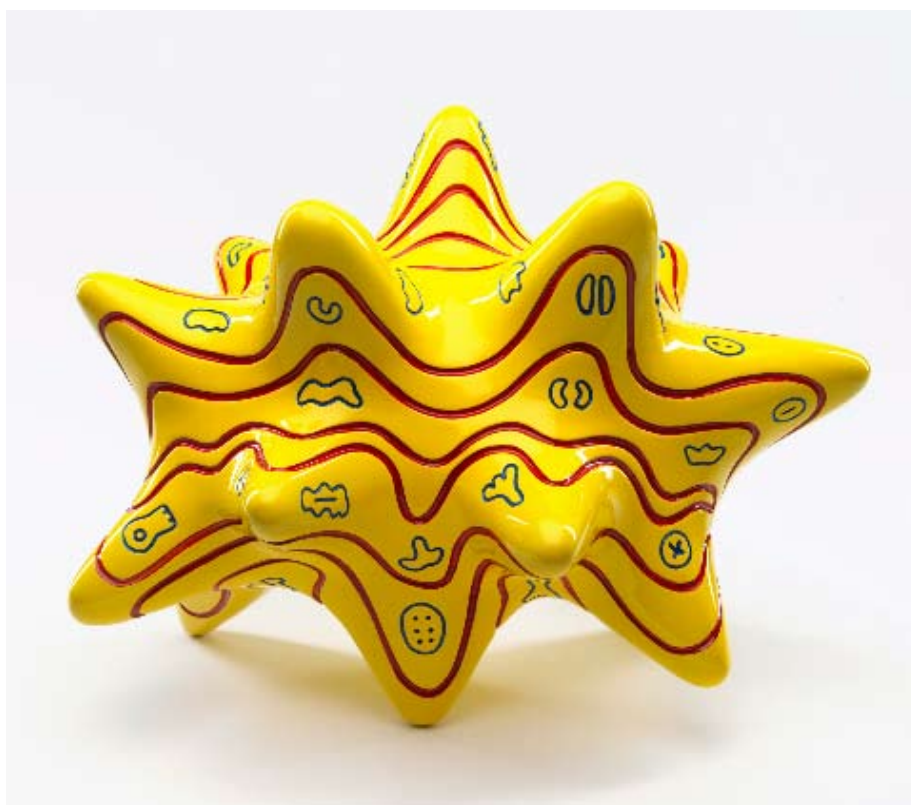
JON BUCK Mind-Map Bronze

Jon Buck's first major one-man London show offers a collection of bright, bold sculptures that defy an art world saturated in pure concept and champions the process of making. Buck blurs the boundaries between drawing and sculpture, experimenting with our traditional concepts of dimension in a rarely-seen way. His brilliant colours, simplified forms and direct themes, enable the viewer to look 'behind the lines' and engage in a world of humanity and nature.