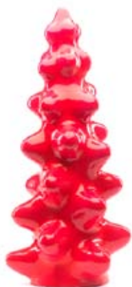
JON BUCK Papilliform