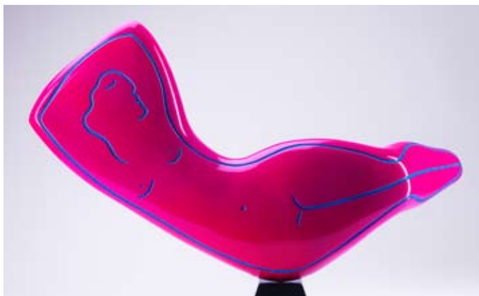
JON BUCK Drawn In