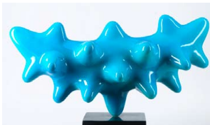
JON BUCK Large Proteiform