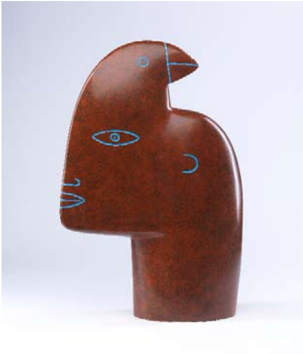
JON BUCK Birdman Bronze