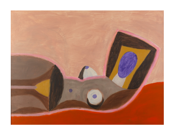
Reclining Nude, 2010, Acrylic on Canvas

Displaying a selection of powerful and poetic work, 'The World Beyond' will explore the relationship between the paintings and sculpture of Breon O'Casey (1928 – 2011), whose unique style is characterised by simple forms and lines, fluctuating between figuration and abstraction. Exhibition highlights will include previously unseen paintings and early sculpture, as well as a selection of hand-crafted jewellery.