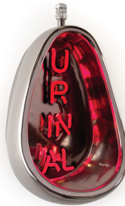
ABIGAIL FALLIS Urinal