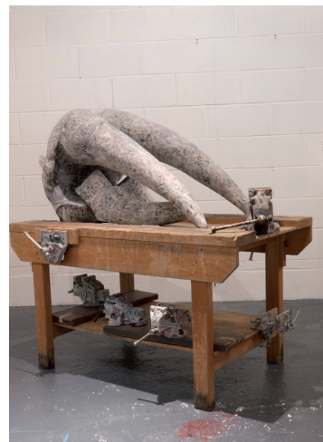
ABIGAIL FALLIS The Walrus & The Carpenter