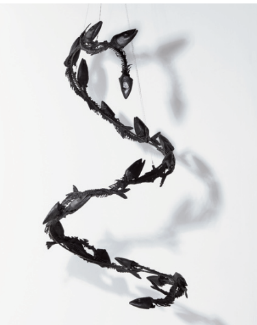
ABIGAIL FALLIS Shoal de Lier