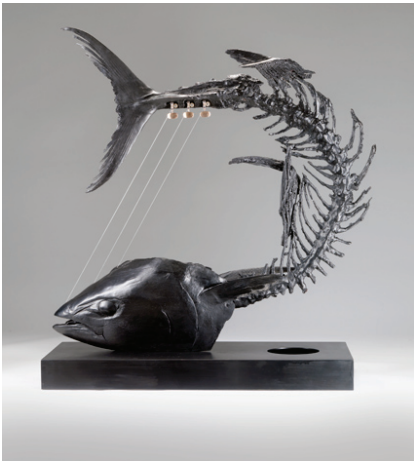
ABIGAIL FALLIS Tuna Fish (with strings attached)

IMAGE SHEET - For press information please contact Paget Baker Tel: 020 7323 6963