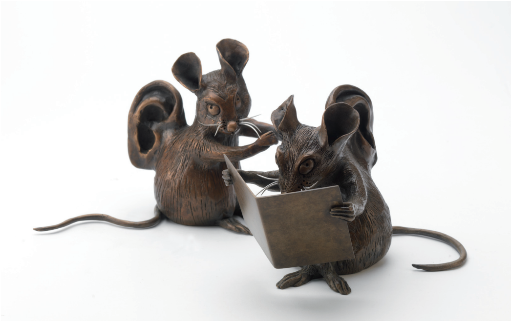
ABIGAIL FALLIS Earmarked for Survival

A gigantic diamond dome, shoals of strange skeletal fish and human heads dissected like packs of cards, meet Marcel Duchamp and the surrealists in 'Fallis in Wonderland', the forthcoming exhibition of sculptures by Abigail Fallis at Pangolin London.