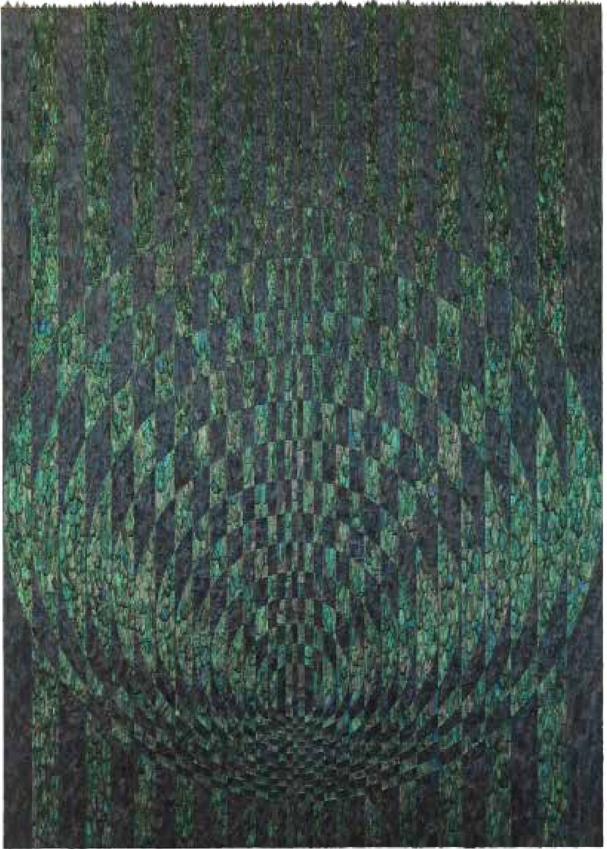
The Beast in Me , 2017, Cockerel & Crow feathers on board, 2.13 m high