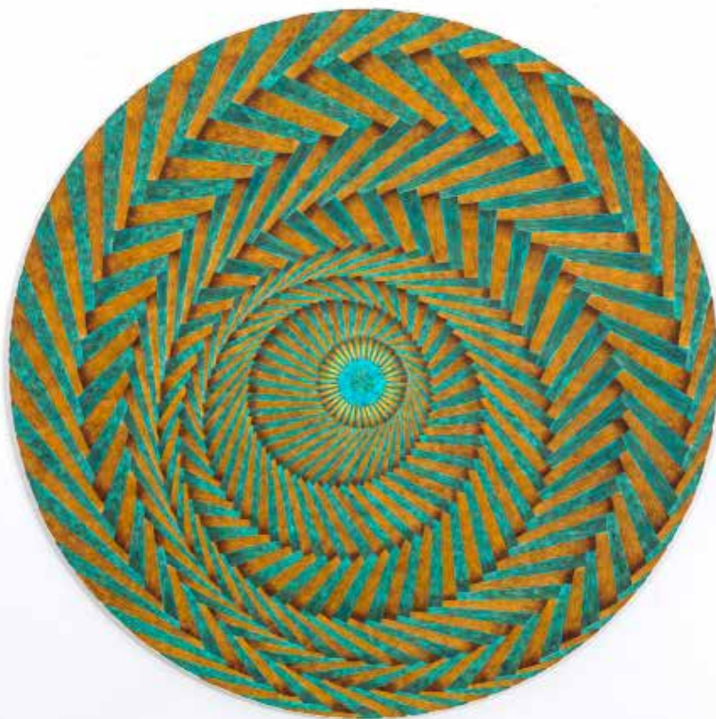
Erotica , 2016, Golden Pheasant & Kingfisher feathers on board, 165 cm diameter

Using her signature medium of exotic feathers, Pangolin London are delighted to present a compelling new body of work by George Taylor - her first major solo show in London since 2008.