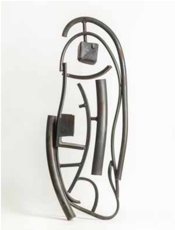
JANUS, 2015, ZINC COATED AND PAINTED MILD STEEL