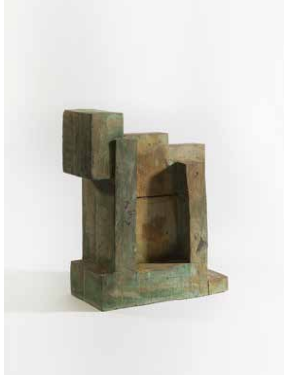
STUDY FOR EGYPT 1991, BRONZE