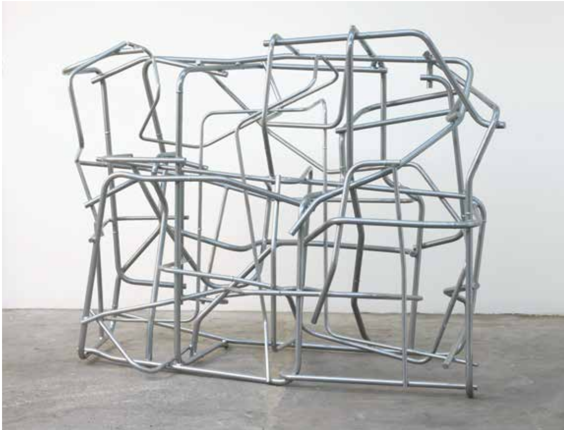
THE VENTRILOQUIST, 2015, POWDER COATED STEEL

"Jeff Lowe's sculpture and drawings speak the universal language of sculpture"