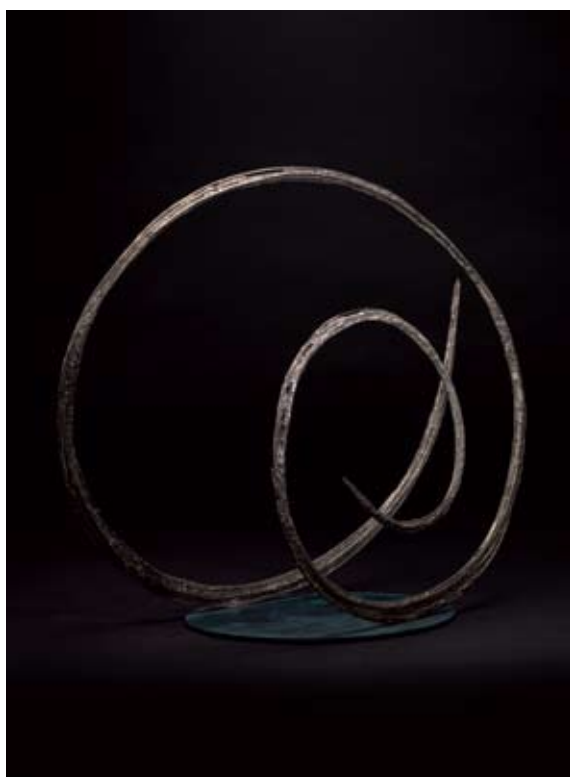
CHARLOTTE MAYER Release