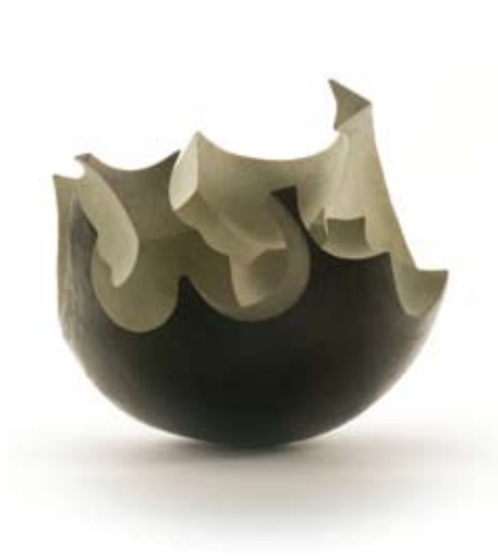
Almuth Tebbenhoff Empty Sheres