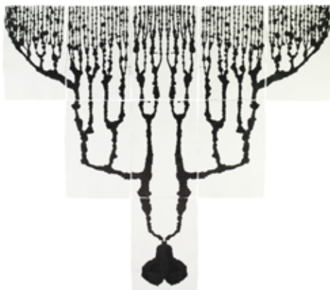
SOURCE SEED I , 2013 BLACK INK ON PAPER UNIQUE 300 X 340 CM