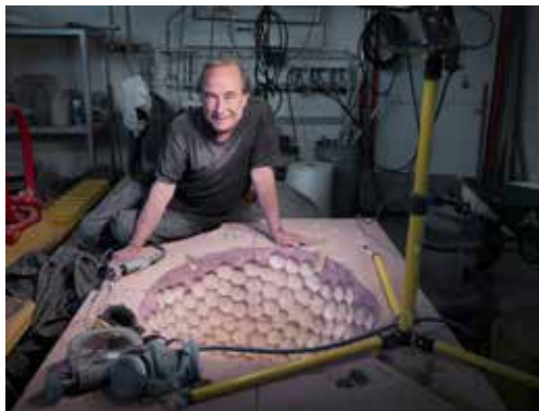
PETER RANDALL-PAGE WORKING ON THE SAND MOULD FOR BRONZE AT PANGOLIN EDITIONS FOUNDRY, 2014