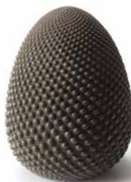
MAQUETTE FOR SEED , 2007 BRONZE EDITION OF 12 24 CM HIGH