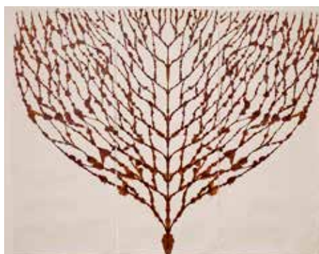
BLOOD TREE I , 2013 BURNT SIENNA INK ON PAPER UNIQUE 198 X 255 CM