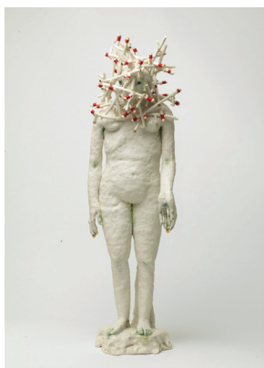
CLAIRE CURNEEN Stick Figure