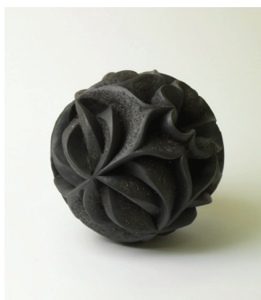
HALIMA CASSELL Noir