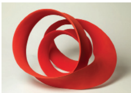
MERETE RASMUSSEN Red Form