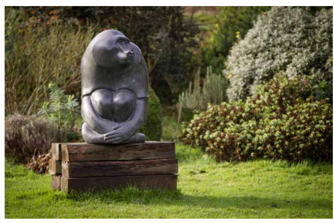
IMAGE: Michael Cooper, Baboon, Bronze, Edition 2 of 6, 88 x 44cm. Pangolin London

Pangolin London will present an ambitious exhibition that brings the 'outdoors in' and will convert its sleek, architectural gallery space into a lush formal garden complete with trees and water features. 'Sculpture in the Garden' is the second exhibition in the series created by Pangolin London, which started with 'Sculpture in the Home' in 2014 which was based on the touring exhibitions of the same name curated by the Arts Council England in the 1940s and '50s. These exhibitions offer an opportunity to view sculpture in a fresh and different way and encourage audiences to engage with sculpture beyond the traditional gallery or museum setting.