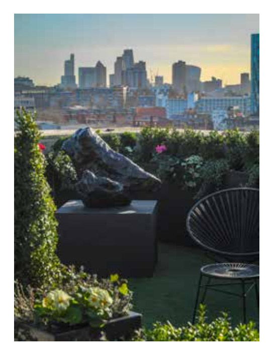
WILLIAM TUCKER Void