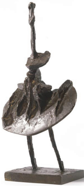
BERNARD MEADOWS Maquette for Flat Bird 1956, Bronze