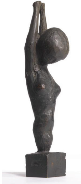
REG BUTLER Study for Fetish 1959, Bronze

Highlighting the continued significance of sculpture in everyday life, Pangolin London's contemporary revision of the show features work by a host of prominent post-war sculptors. Works by many of those artists featured in the original Arts Council exhibitions including Reg Butler, Lynn Chadwick, Geoffrey Clarke and Bernard Meadows will be featured among an intimate setting of exquisite period textiles and furniture.